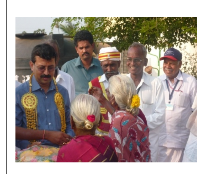
District Collector Visited for distributed relief to Thana In TEV