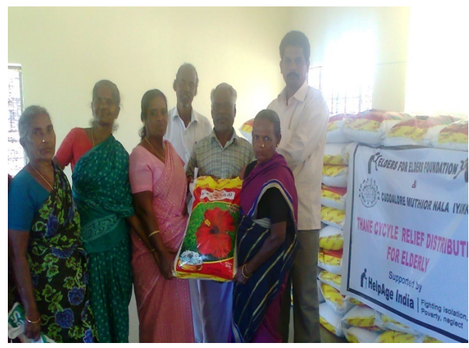
Thane cyclone relief Materials distribution activity by EfE Director and Chairman -